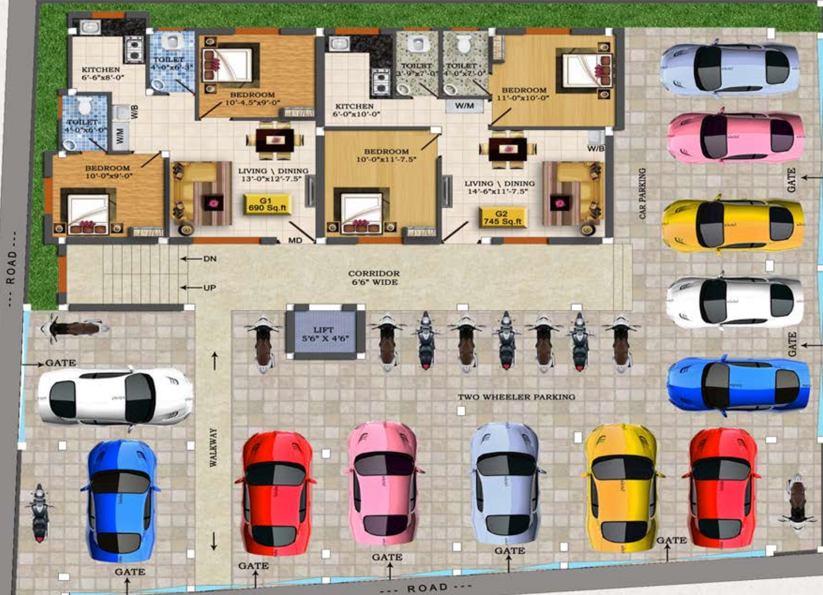
SITE CUM GROUND FLOOR PLAN